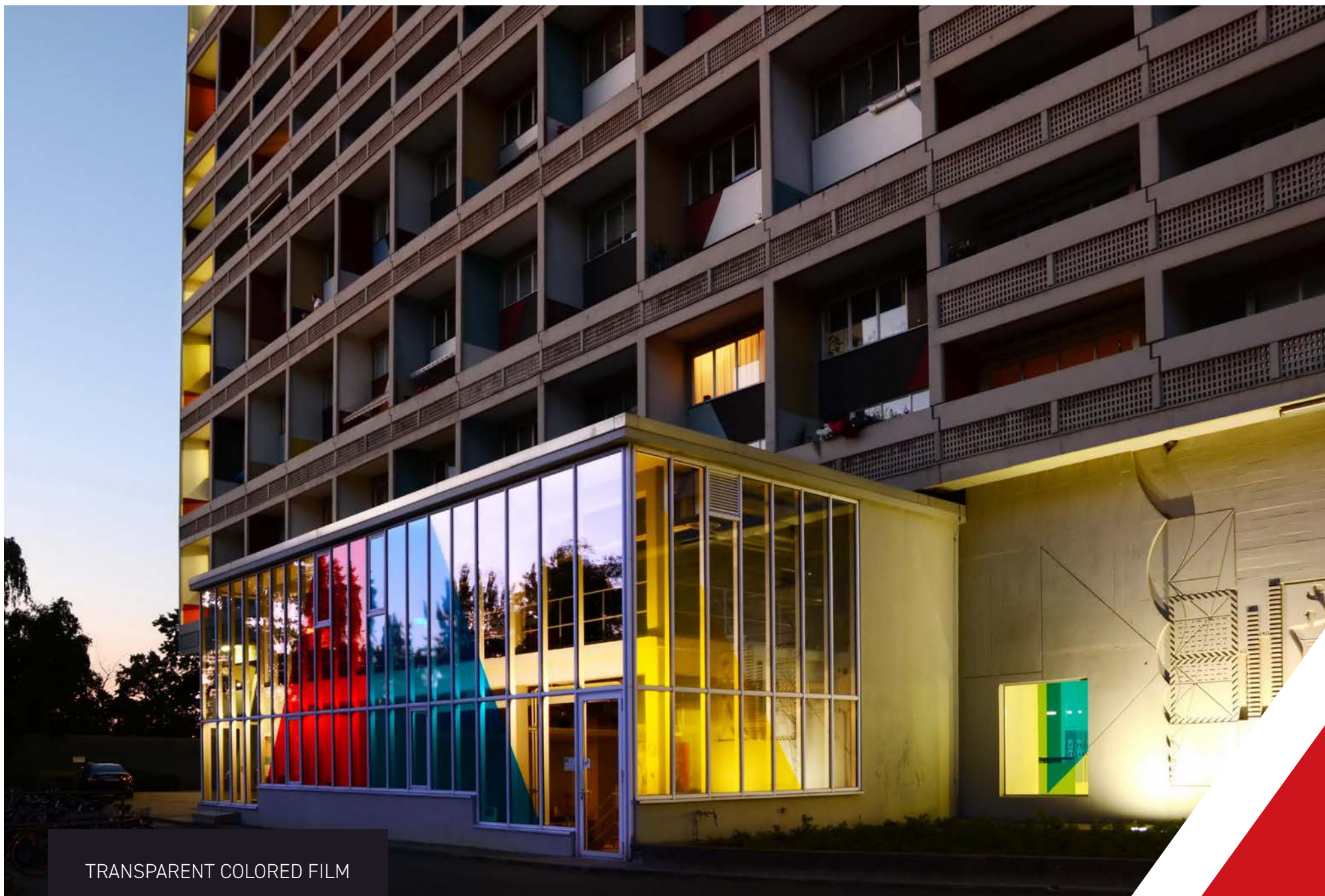
TRANSPARENT COLORED FILM